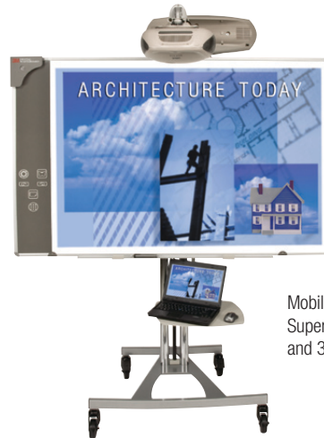
Mobile Stand shown with 3M™ Super Close Projection SCP712 and 3M™ Digital Board

Two (2) locking casters to prevent unwanted movement